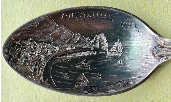
Caption 4 - "Catalina Cal." (C4)

on Gorham Versailles pattern (woman and cherub)